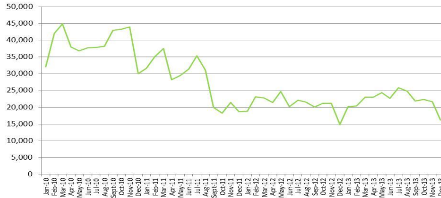
Figure 1a Electricity Total Monthly Switches Jan 2010-December 2013