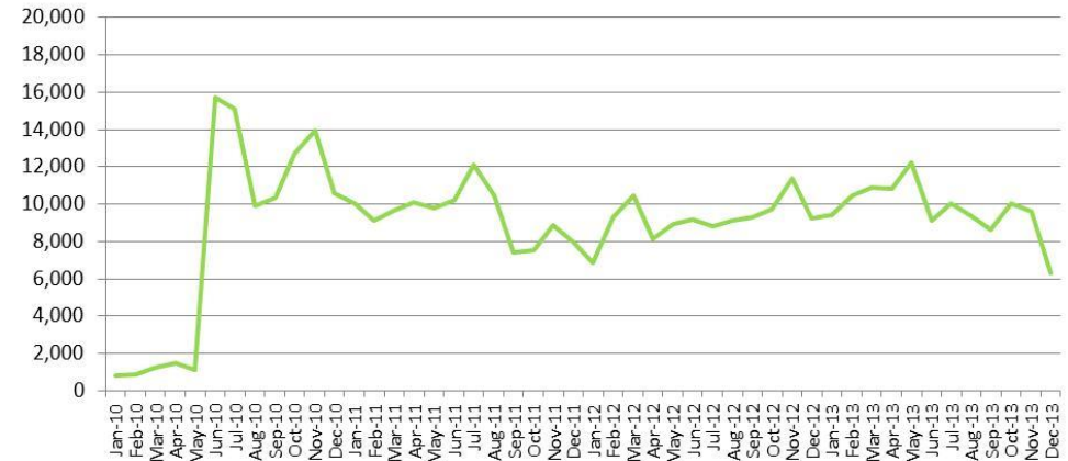
Figure 2a Gas Total Monthly Switches Jan 2010- December 2013